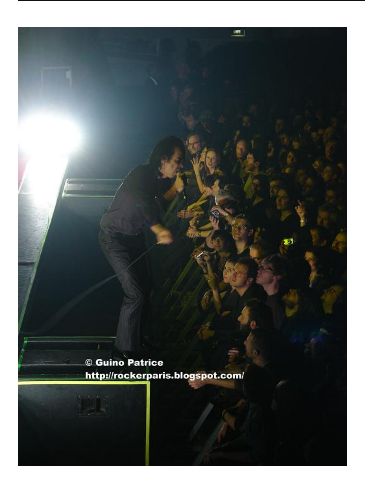
Klewer Serial Litigants